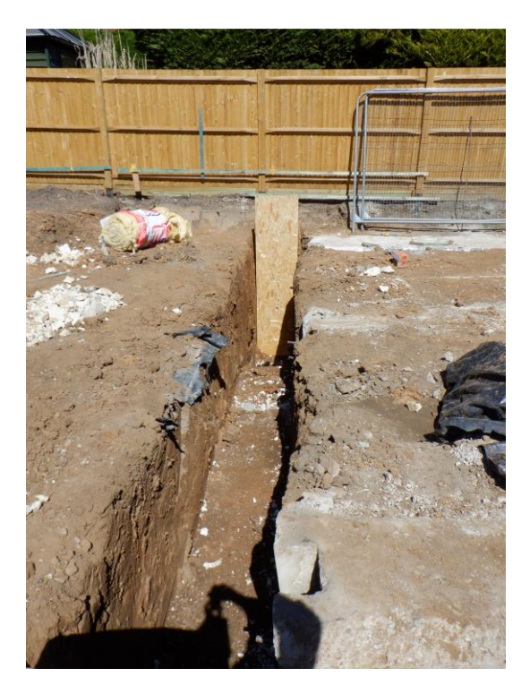
Plate 9. View of foundation trenches (looking NW)