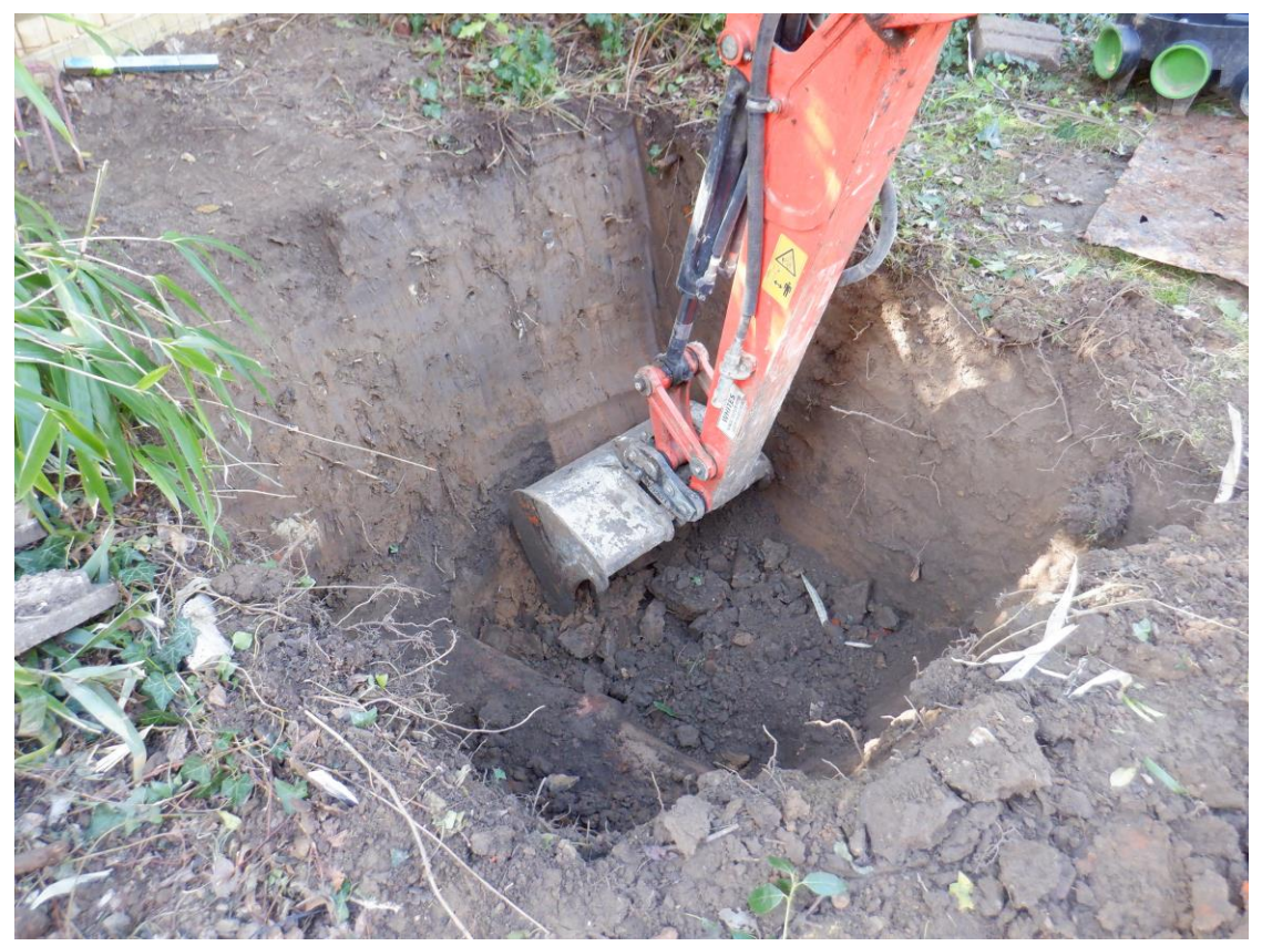
Plate 4. View of drainage soakaway