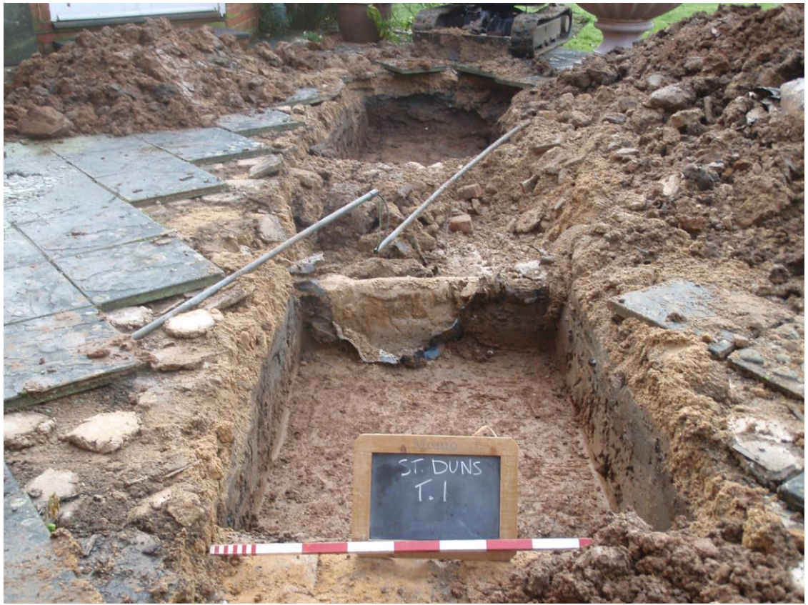
Plate 2. Archaeological evaluation Trench 1