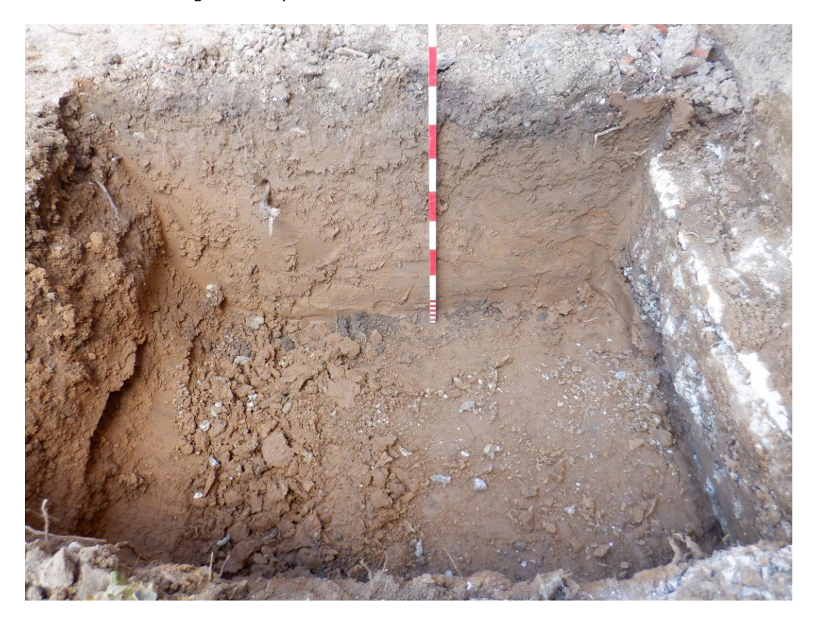
Plate 5. View of completed soakaway