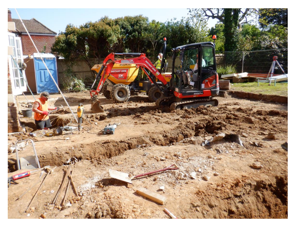
Plate 3. View of foundation trenches (Watching Brief)