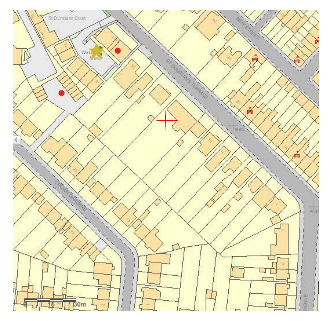
Plate 1. KCC HER map of site (red target) showing the site prior to development.