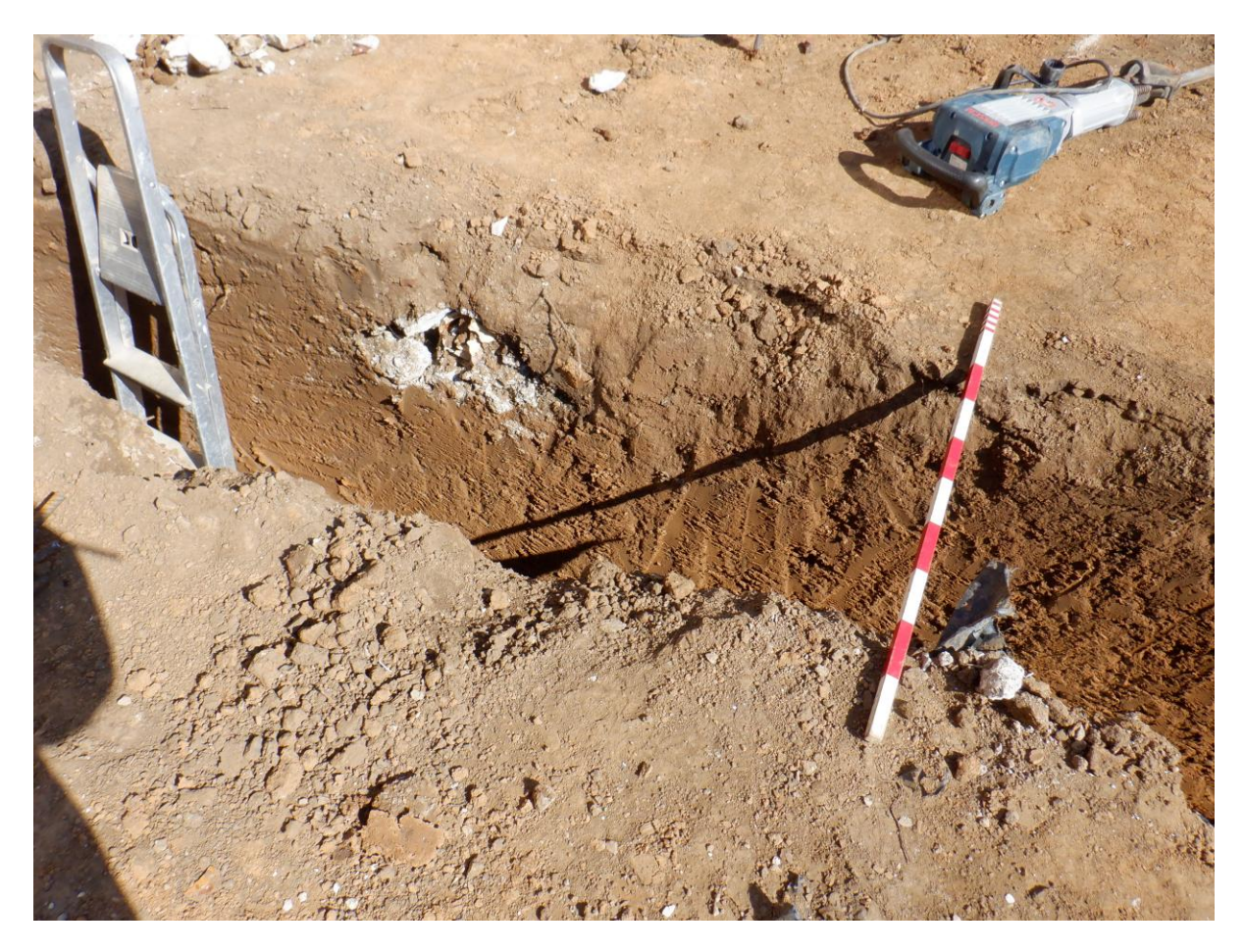
Plate 8. Completed foundation trenches (looking SSE)