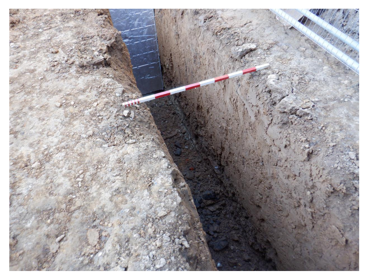
Plates 6. View of foundation trenches (looking NE)