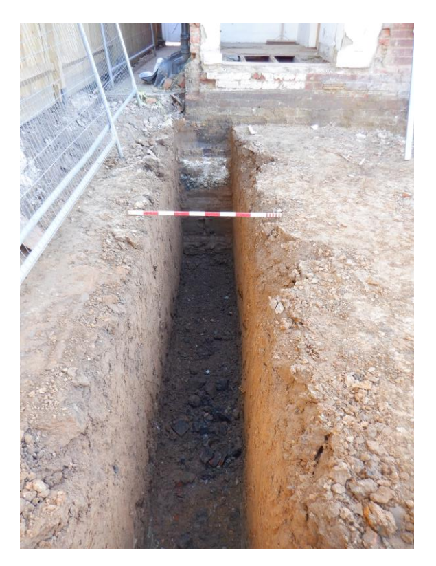
Plate 7. View of foundation trenches (looking E)